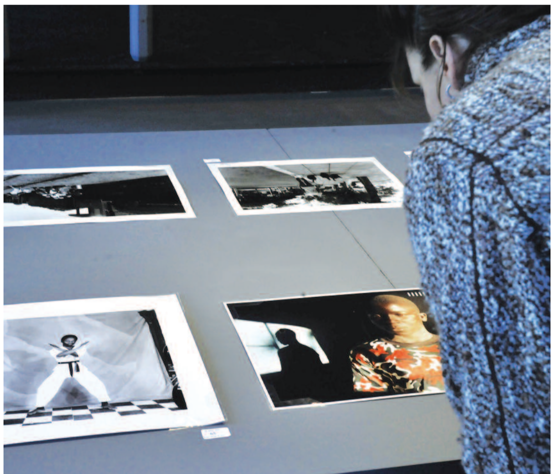
A woman looking at pictures, part of 300 lots of African photography, a day before the vintage photographs go under the hammer in Brussels.