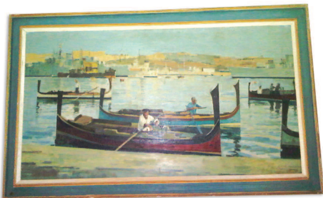
The oil on canvas Bryan Organ painting, purchased by then Prime Minister George Borg Olivier while in London during the 1960s, will also go under the hammer.

This painting was purchased by then Prime Minister George Borg Olivier while in London in the 1960s.